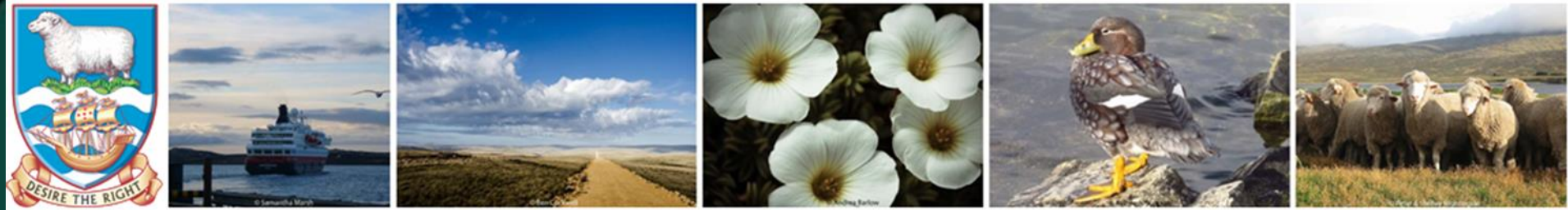
FIG Treasury Facts and Figures

Income for financial year 2017/18 of £100m;